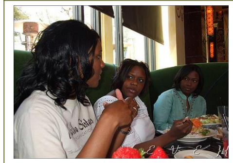
Houston Branch Meet the National President September 6, 2008

Mocha Sisters Organization–Houston Branch P. O. Box 6505 Houston, TX 77265–6505 www.mochasistershouston.org info@mochasistershouston.org