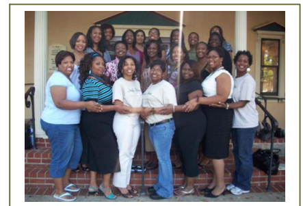
Embracing the Vision: Workshop Series September 27, 2008 Dallas, TX

"Forming a bond or connectedness with the Organization"