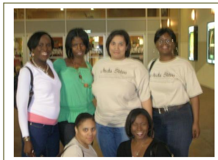
Houston Branch Sisterhood Social: Movie Night

“Improve the lives of others within our community while promoting sisterhood.”